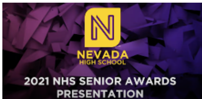
Senior Awards Presentation