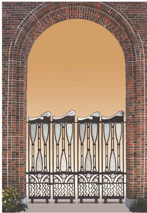
Shown above is a drawing of The River Gates, constructed in 2011 as part of Project AWARE through the Iowa DNR.