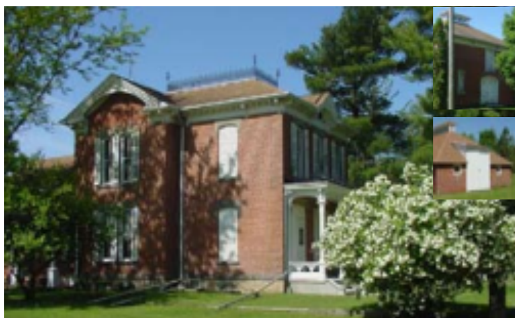
Briggs Terrace/Evergreen Lane 1204 H Avenue