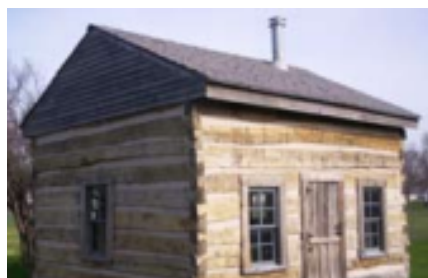
George Child Log House 1204 H Avenue