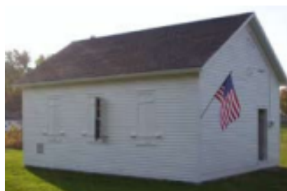
Halley School 1204 H Avenue