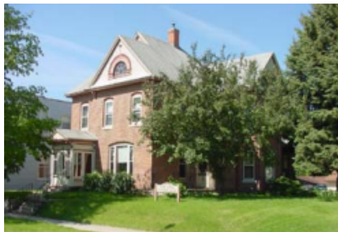
Dyer-Dowell Victorian House 922 5th Street