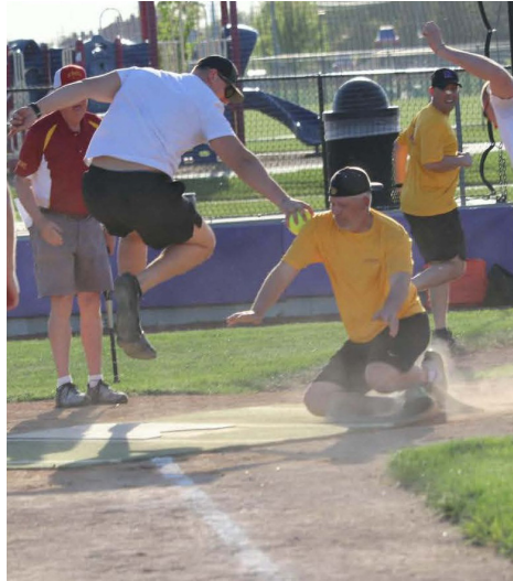
This photo from the 2025 first-ever game between Nevada's Hometown Heroes and Iowa State student athletes shows the hustle, fun and passion that the athletes brought to this game!